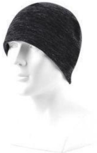
45 ° incline